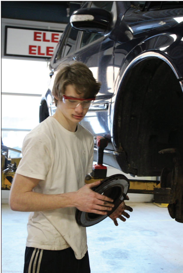
Auto students are shown participating in automotive repair.

Anchor Bay Schools Armada Area Schools Center Line Public Schools Chippewa Valley Schools Clintondale Community Schools Eastpointe Community Schools Fitzgerald Public Schools Fraser Public Schools Lake Shore Public Schools Lakeview Public Schools L'Anse Creuse Public Schools Mount Clemens Community Schools New Haven Community Schools