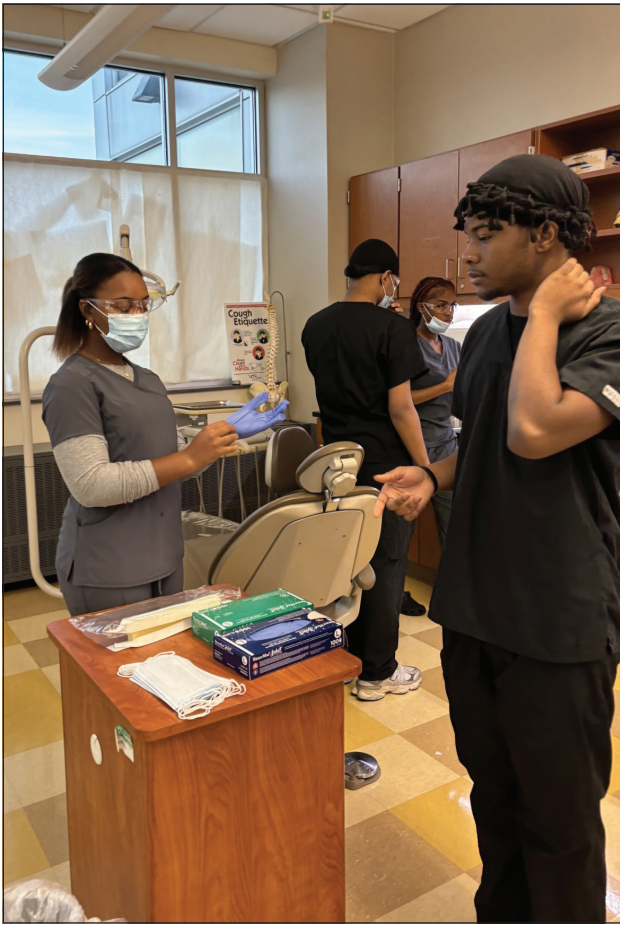
Dental students preparing for a dental lab.