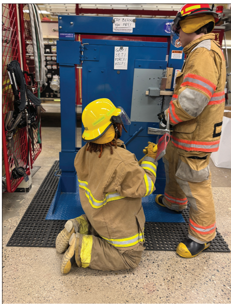
Firefighting students practicing forcible entry techniques essential for accessing locked buildings and homes.

"CTE is an incredible opportunity for students to gain hands-on experience and explore