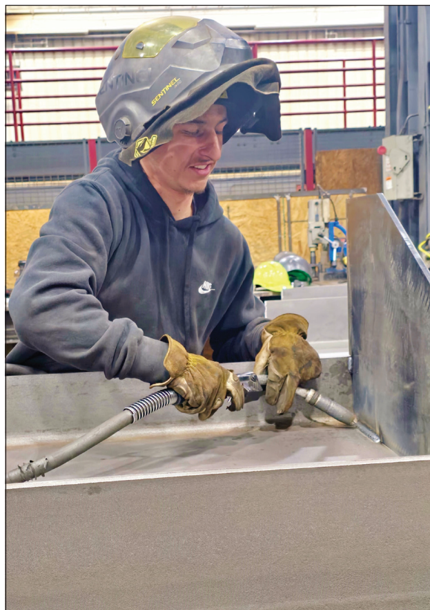
CLHS graduates, now employed at Casadei, gained hands-on experience through CTE welding class and industry support.