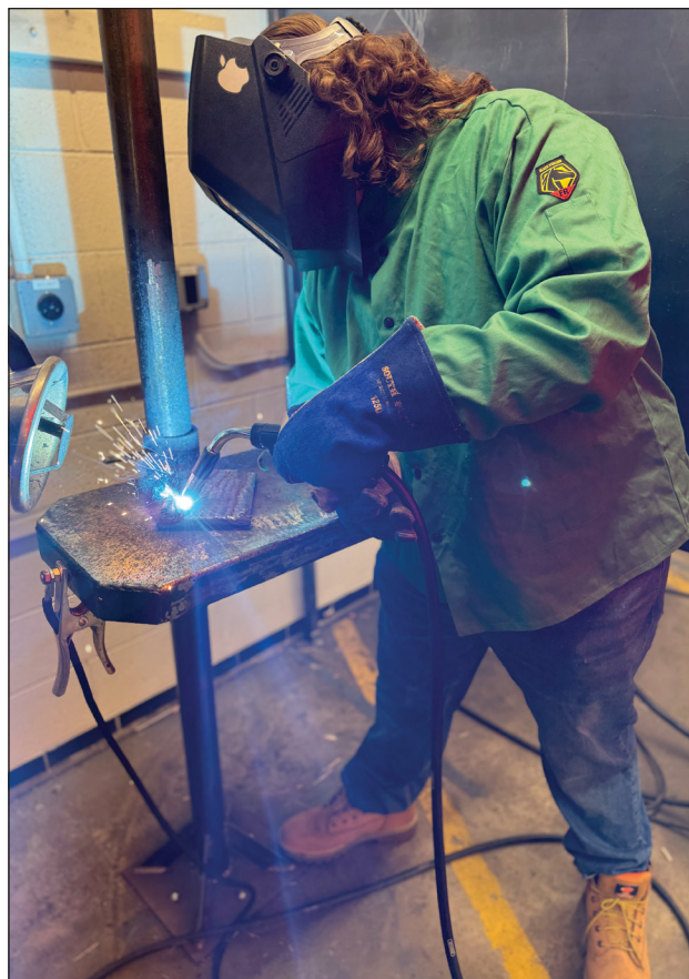
Welding students develop skills in MIG, TIG, and STICK as part of their training.

Anchor Bay Schools Armada Area Schools Center Line Public Schools Chippewa Valley Schools Clintondale Community Schools Eastpointe Community Schools Fitzgerald Public Schools Fraser Public Schools Lake Shore Public Schools Lakeview Public Schools L'Anse Creuse Public Schools Mount Clemens Community Schools New Haven Community Schools